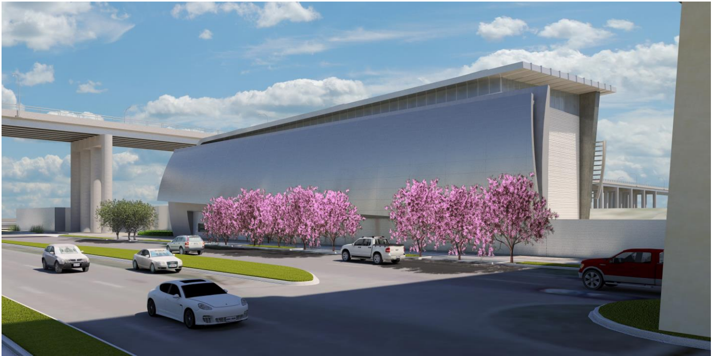
Rendering of Able Pump Station

Featuring the Largest Concrete Volute Pumps in U.S.