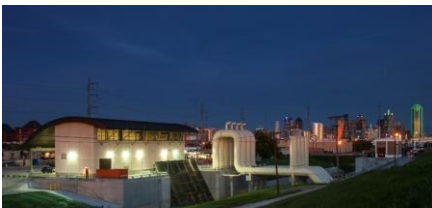
Baker No. 3 Pump Station

Able Pump Station 615 S. Riverfront Blvd. Dallas, TX 75207